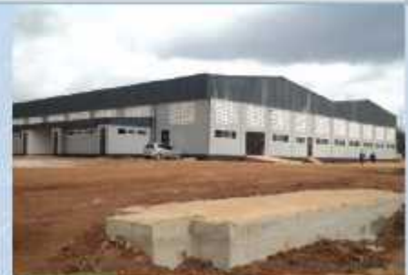
LOT I WARE HOUSE BUILDING