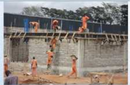
LOT II RING BEAM CASTING OF CANTEEN BUILDING