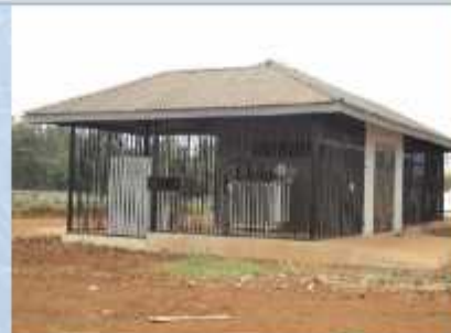
LOT I POWER HOUSE BUILDING