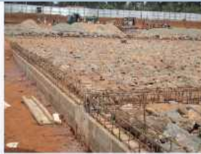
LOT I HARD CORE LAYING AND GROUND BEAM REINFORCEMENT FIXING