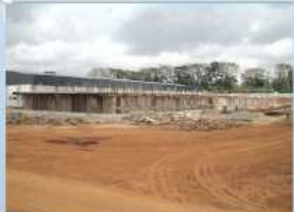
LOT I CUTTING AND STITCHING AND LASTING BUILDING