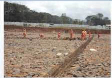
LOT I HARD CORE LAYING IN TANNERY BUILDING