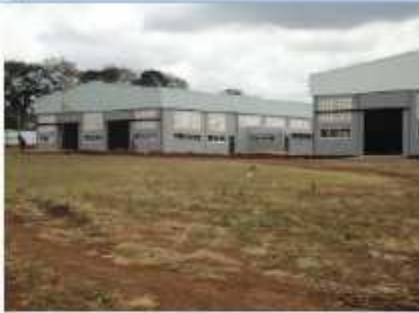
LOT I CUTTING AND STITCHING AND LASTING BUILDING IN OPERATION