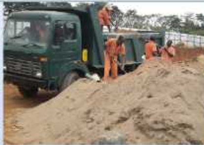
LOT II SHIFTING OF MATERIALS INSIDE THE SITE.