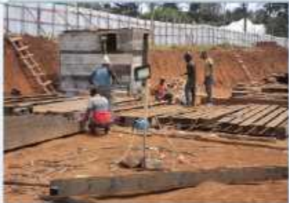
LOT I CUTTING OF I-SECTION COLUMN AND BOTTOM PLATE WELDING FOR TANNERY BUILDING